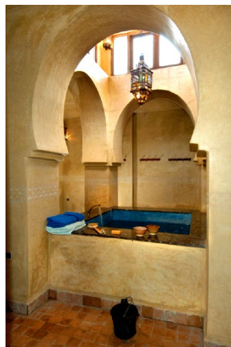
And the Hammam is just as wonderful an experience as ever!