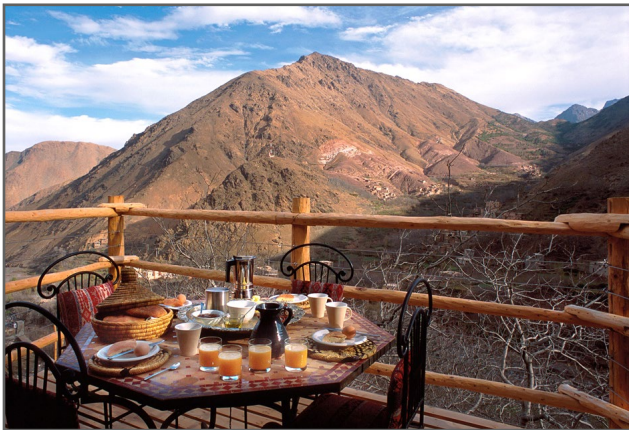
What a wonderful view to start the day with!