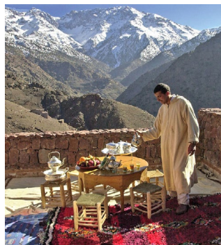
Majestic mountains feel almost within touching distance in the tranquil Azzaden Valley