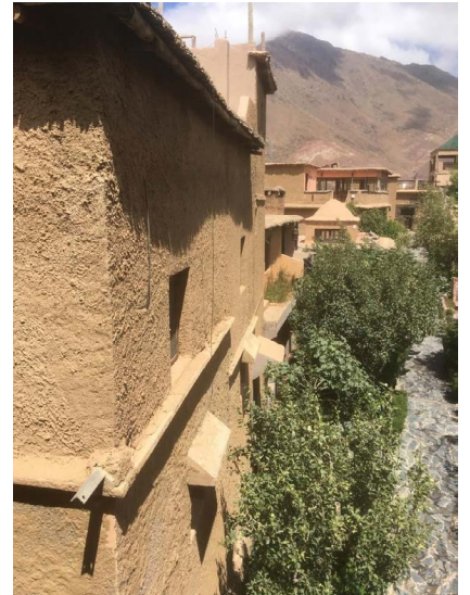
"The new build prevailed."

The Kasbah is closed until further notice but it most certainly will be back. "We'll build it bigger and better," said Gilly McHugo, Mike's wife, "with maybe a panoramic window with that wonderful view where the hole is now at the back of the dining rooms."