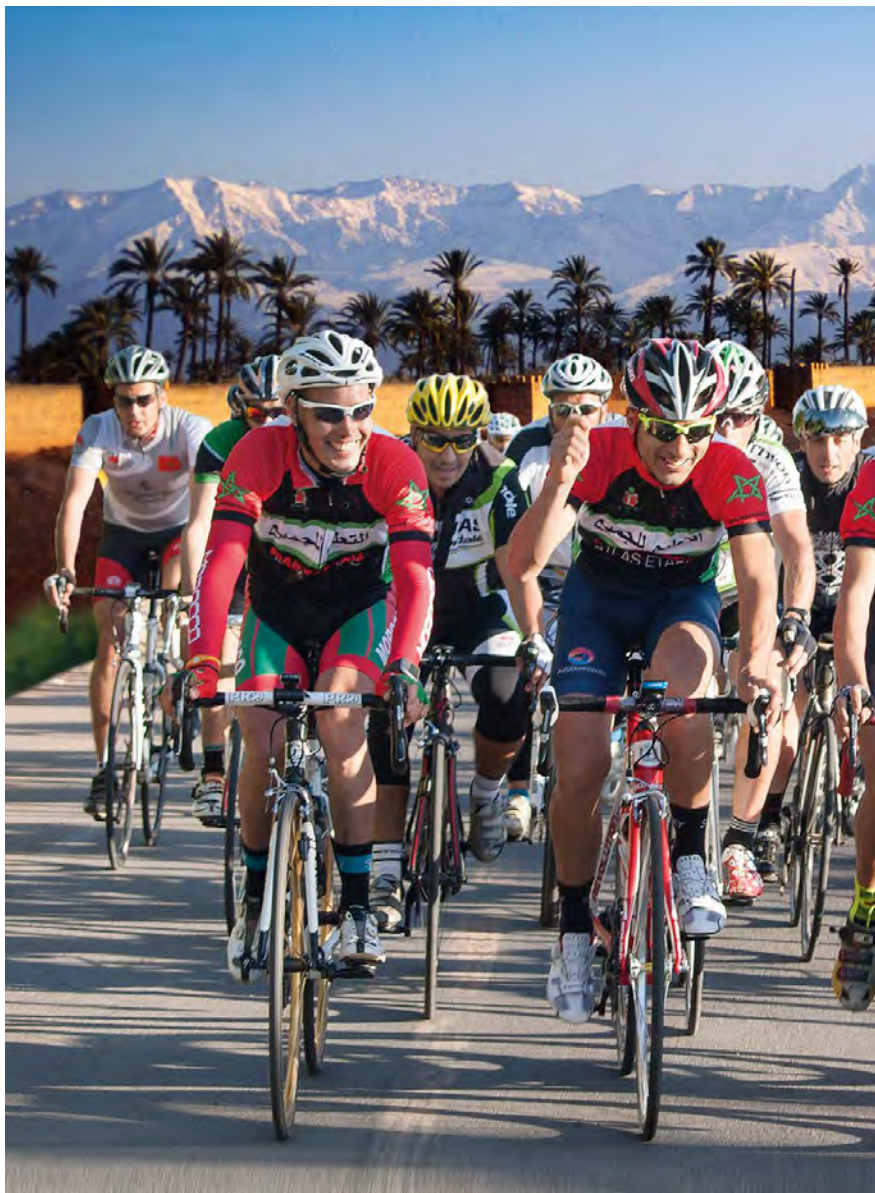
Marrakech Atlas Etape, annual cyclo sportive, last Sunday in April